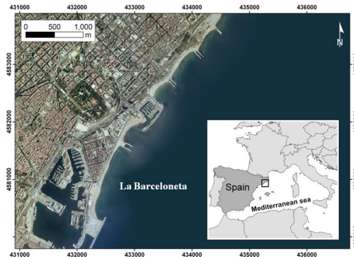
Fig. 1. Localization of La Barceloneta beach. The beach presents the morphological configuration before the construction of the detached breakwater.

The city of Barcelona is located in the north-western Mediterranean (Fig. 1) and has approximately 13 Km of coastline containing the city harbour in the southernmost part of the city, three marinas and more than 3 km of beaches. These beaches were created as a part of the renewal plan that took place in the zone for the 1992 Olympic Games.